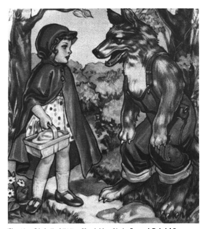
Fig. 12: Little Red Riding Hood, New York: Samuel Gabriel Sons, Illustrator: unknown.

she gazes into his eyes which are practically on the same plane as hers while he leans on his cane and addresses her in a friendly way. It is as though he were standing on a corner waiting for her to come by. Here there is a clear separation of the figures emphasized by the straight stick which keeps them apart. Also, in the background we see some woodcutters, the social guardians of morality, who guarantee that the girl and wolf will behave themselves. This is why the eye contact is important, for they