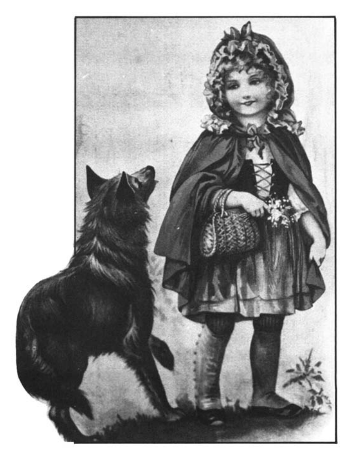
Fig. 9: Friends from Fairyland, London: Raphael Tuck & Sons, c. 1880. Illustrator: unknown. This book, part of Father Tuck's 'Ever Welcome' Series, was designed in England and printed in Germany. Tuck had offices of distribution in London, Paris, Berlin, New York, and Montreal. The above is typical of Victorian illustrations which often portrayed the girl as seductive innocence.

of the literary texts, I demonstrated that the wolf and the girl were essentially one and the same figure in the minds of the writers, for the little girl is a potential witch with her red hat—witches, evil fairies, and Jews wore red hats in the oral stories which circulated in the late Middle Ages up through the nineteenth century—and the wolf, whose ancestor was the