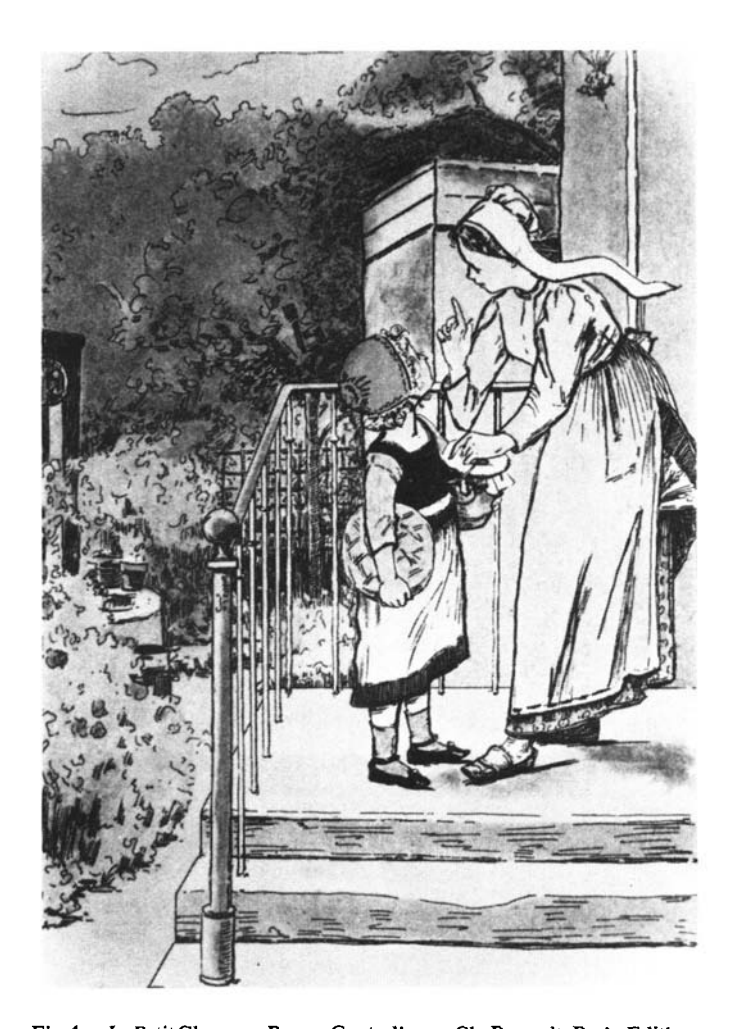
Fig. 1: Le Petit Chaperon Rouge, Conte d'apres Ch. Perrault, Paris: Editions Ruyant, 1979. Illustrator: M. Fauron. This edition is a reprint of a book published by Emile Guerin at the beginning of the twentieth century. The mother is quoted underneath as saying "above all, don't amuse yourself along the way!" The constellation of the temperate mother trying to temper the potentially rebellious or free-spirited daughter is standard fare in the picture books of the last two centuries.