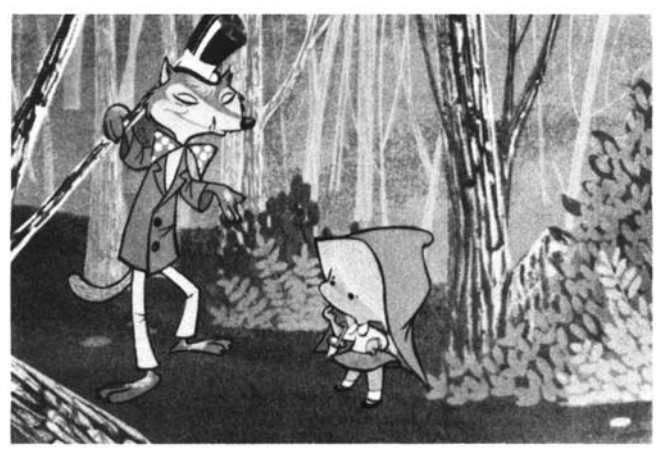
Fig. 15: The Story ov Littl Red Rieding Hood. Chicago: Encyclopedia Britannica Educational Corporation, 1968. Illustrations from Classic Fairy Tales, a series of films produced by Encyclopedia Britannica Films, Inc. Large Corporations such as Walt Disney generally package their fairy-tale productions to obtain maximum profit. Thus the narrative will be simultaneously made into a film, record, picture book, coloring book, poster, and toy.