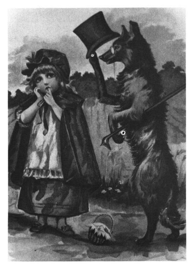
Fig. 13: Father Tuck's Fairy Tale Series, Little Red Riding Hood, London: Raphael Tuck & Sons, c. 1880. Illustrator: unknown. Designed at the studios in England, the narrative was written by Grace C. Floyd.

wolf leans in an intimate way while the girl gazes straight into his eyes. Dressed in overalls, the wolf is obviously an American farmer, and the apple-pie complexion of the girl suggests the sweetness of innocent American girls, who use their innocence as a means of seduction.