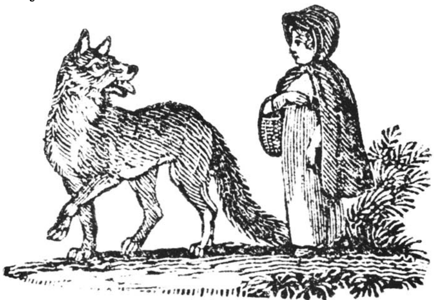
Little Red Riding Hood, New York: J.B. Jansen, 1824. Illustrator unknown. Typical of the early woodblock illustrations, the wolf is as large as the girl, who expresses interest in the wolf instead of fear.

the Brothers Grimm does not call for Little Red Riding Hood to strip—and there are striptease scenes—and get into bed. She is simply gobbled up by the wolf. And, as in figure 7, she owes her salvation and life to a male who is likened to a father figure. Explicit in these illustrations is that a girl receives her identity through a man, and that without male protection she will destroy herself and reap chaos in the world outside.