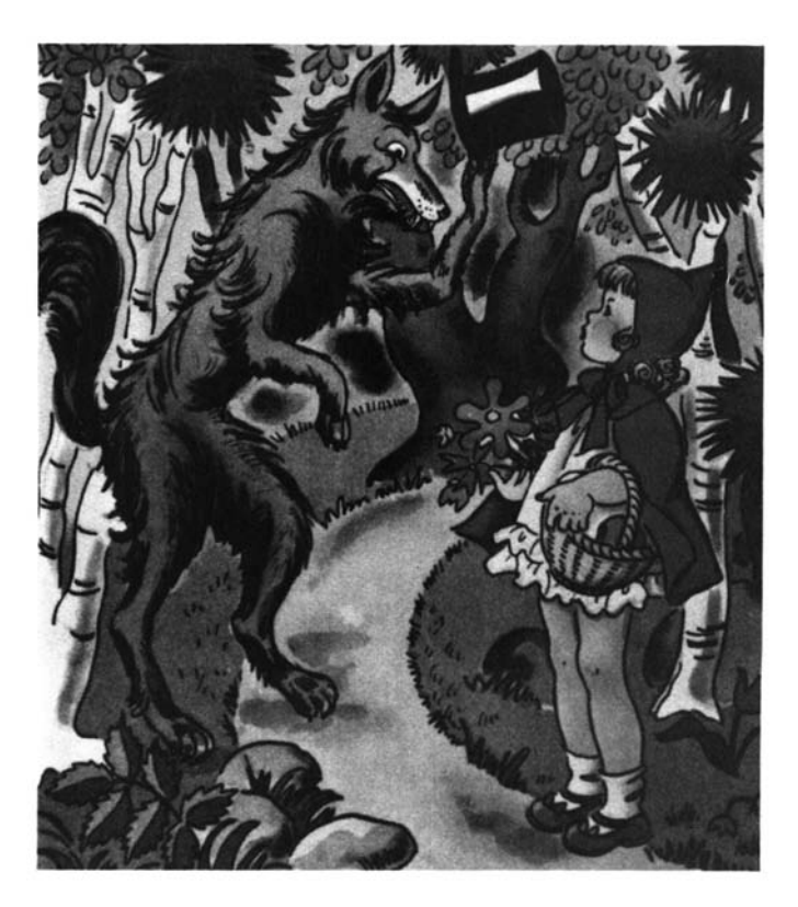
Fig. 16: The Gingerbread Boy, Little Red Riding Hood, and the House that Jack Built, Racine, Wisconsin: Whitman, 1945. Illustrators: Hilda Miloche and Wilma Kane.

Ironically, the portrayals of the wolf and the girl were more erotic and sensual in the nineteenth-century and early part of the twentieth century than they are today. Michel Foucault has suggested that the Victorians were more obsessed and interested in sex than we believe. <sup>16</sup> That is, given the proliferation of discourses around sexuality which began in the nineteenth century, Foucault calls into question the very notion of repression. Certainly, in the case of Little Red Riding Hood , writers and illustrators were not afraid to make sex the major subject of their discourses. Historically speaking the traditional nineteenth-century depictions of the girl/wolf encounter bear out Foucault's assertions: they reveal a deep longing for sexual satisfaction, a pursuit of natural inclinations against conformity