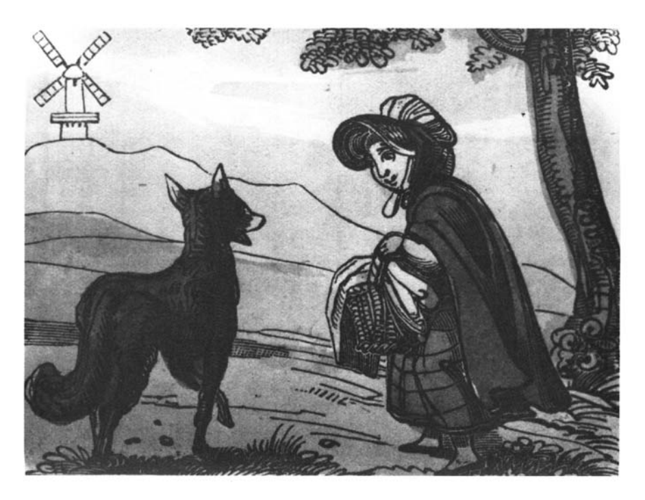
Fig. 3: The Sleeping Beauty in the Woods and Little Red Riding Hood. London: Dean and Munday and A.K. Newman, ca. 1830. Illustrator: unknown. Here the girl appears to smile in a friendly fashion and to be willing to help or accompany the wolf.

The wiles of Red Riding Hood are many, or to be more exact, the iconic projections of illustrators reveal a great deal about the semiotic means of fairy-tale illustrations which serve to corroborate male notions about sexuality and rape. Here I should like to focus on several illustrations selected from well over 500 that have recurred with significant regularity in similar shape. Not only do they suggest that Little Red Riding Hood is guilty for her own rape, but they reveal a curious ambivalence about male fantasies which needs more explanation.